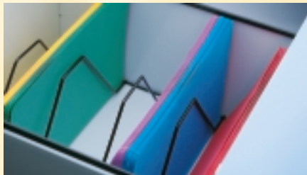
Drawer File Rack Divider