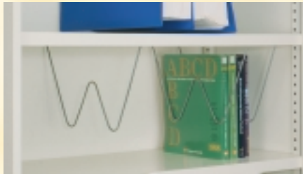
Sliding Wire Divider