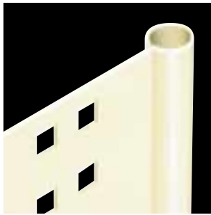
LIGHT DUTY (RUT) UPRIGHT