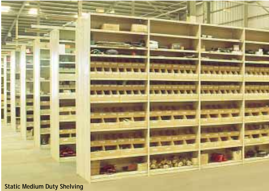
Static Medium Duty Shelving