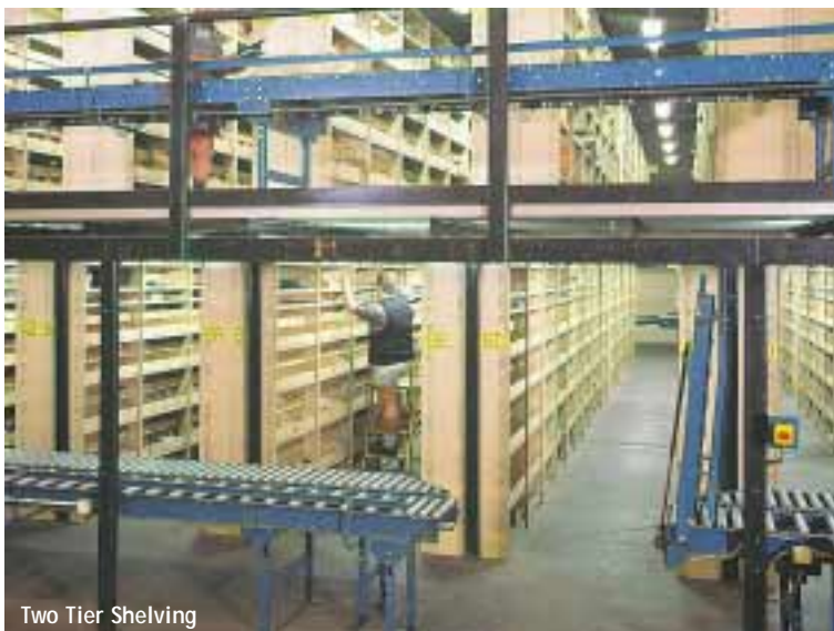
Two Tier Shelving

Brownbuilt's on-going development of RUT shelving has resulted in Australia's most comprehensive light and medium duty, applications-based shelving system, with a wide range of standard component sizes and configurations to maximise storage areas. Where storage requirements dictate a customised solution, Brownbuilt storage consultants and engineers can also design and manufacture an individual RUT shelving installation with tailored dimensions to maximise storage capabilities.