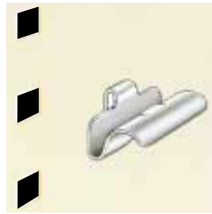
LIGHT DUTY SHELF CLIP