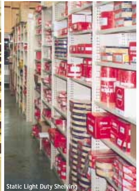
Static Light Duty Shelving

Brownbuilt has been an industry pioneer since 1885 and has been responsible for many technical innovations in storage systems during that time. Brownbuilt's position as Australia's leading supplier of shelving systems reflects a philosophy of continued investment in modern technology, use of the highest quality components and design flexibility.