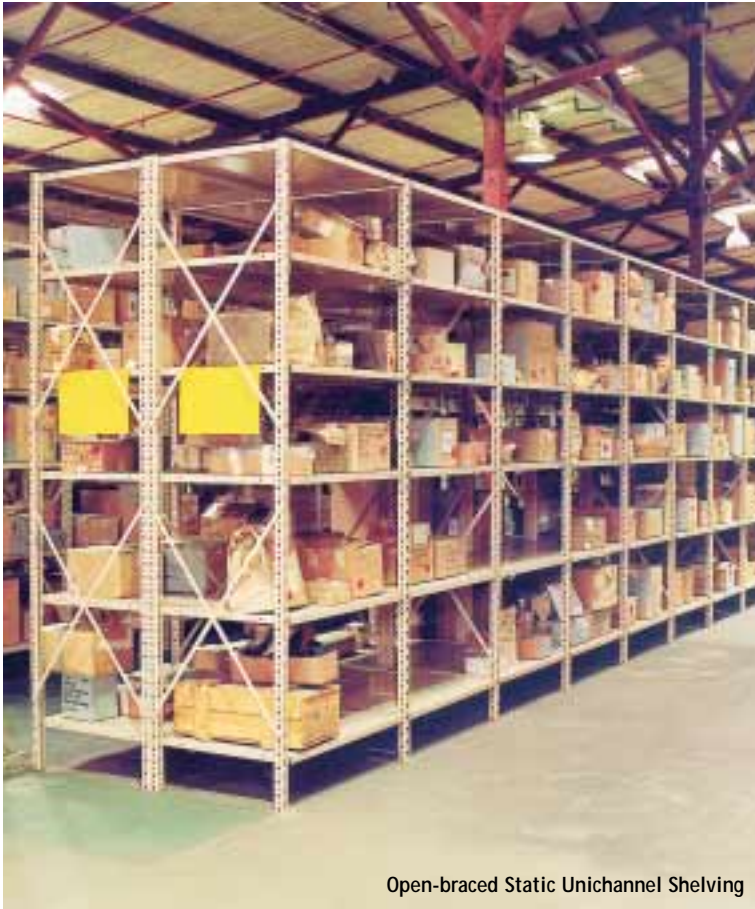
Open-braced Static Unichannel Shelving

Unichannel can be adapted for individual storage applications ranging from open structures to fully enclosed storage units using a wide range of accessories for added flexibility.