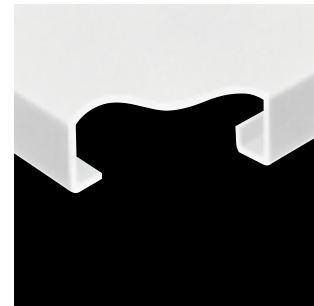
MEDIUM DUTY (RUT) SHELF