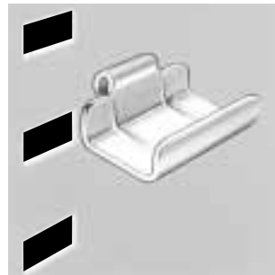
MEDIUM DUTY SHELF CLIP